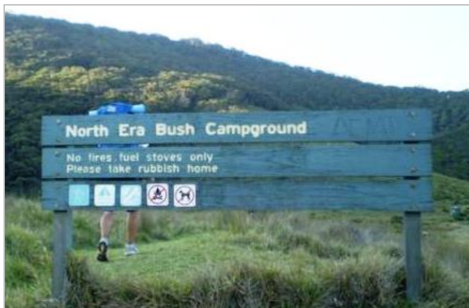
North Era campsite today

So, when you next stroll along North Era Beach, do a detour inland and see the land we used to own, and where Members of SBW were to be found camping on most weekends. Perchance we should arrange for a Plaque to be installed to commemorate our past association and contribution to the conservation of this scenic spot?