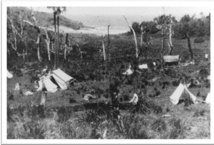
Early photo of the North Era Campsite

Many Members will have done one of our "classic walks" from Bundeena to Otford. This is a spectacular coastal walk with a wide variety of stunning scenery. A rest stop/Lunch is often enjoyed at North Era Beach and a swim indulged in. What many Members may be unaware of is that, before the National Park was extended, the club used to own some of the land, just in from the coast over the years 1947-52.